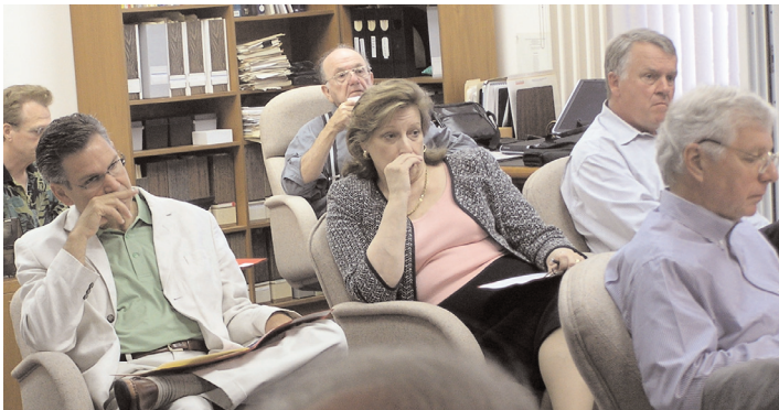
Attendees at the May 16, 2008 Hoyt Fellows session