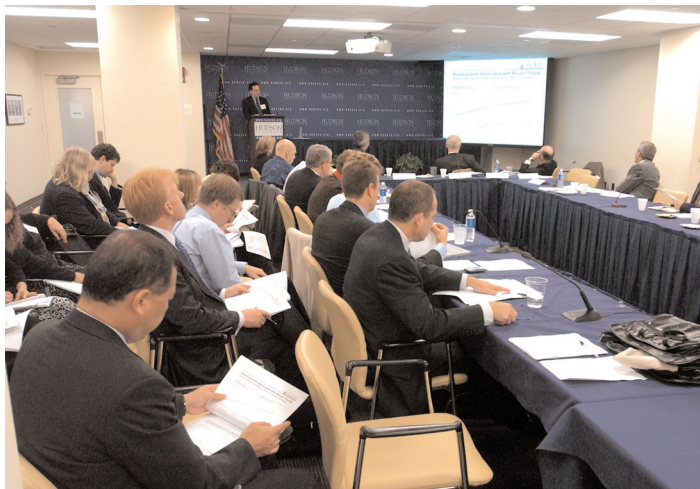
October 24th Research Roundtable in session.