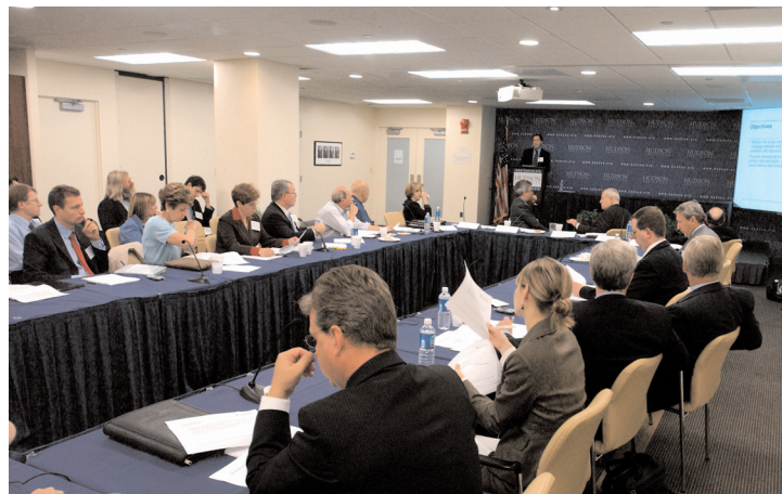
October 24th, 2007 Research Roundtable session