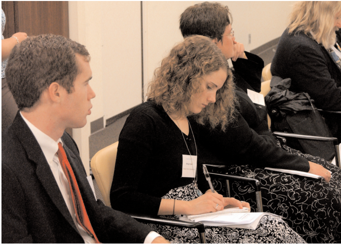
Other participants in the Research Roundtable session