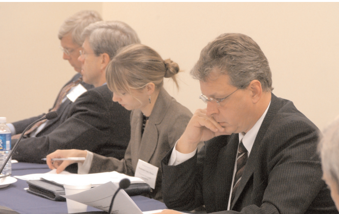
More participants of the research Roundtable